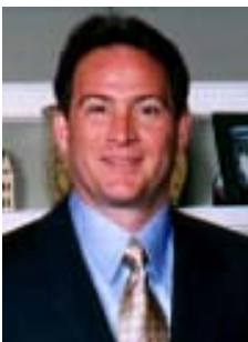
by Ken Meyers President MCT Dairies Inc.

The U.S. dairy product markets are likely to become more complex as a greater percentage of U.S. produced powder captures a larger percentage of global powder markets. Given the near-monopoly of the nonfat